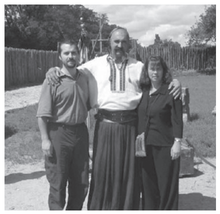
Me and my wife with a Ukrainian cossack at the Cossack Horse Theater in Zaporizhya, Ukraine.