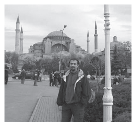
The Hagia Sofia mosque, formerly the center of the Eastern Orthodox church, in Istanbul, Turkey.