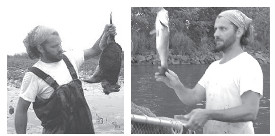
Field sampling for an EPA-funded project to develop indicators of ecosystem integrity in Great Lakes shoreline habitats.

To round out this mini-bio: I've taught at UW-Whitewater and Northern Michigan University, earned a PhD at Michigan State University, an MS in Forest Resources at the University of Minnesota, and started my fascination with bugs in wet places while working at the Metro Mosquito Control District in the Twin Cities twenty years