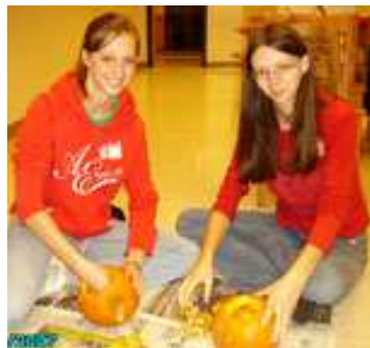
Mentoring Social Event #1 Carving pumpkins and the Halloween Scavenger Hunt