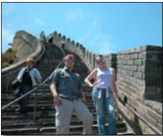
Experiencing the Great Wall of China, Beijing