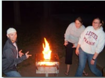
History Club members unwind after a busy semester.